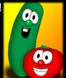
Veggie Tales Merry Larry and the True Light of Christmas