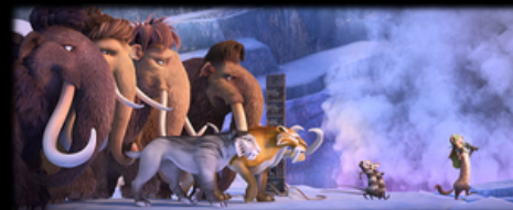
Ice Age Mammoth Christmas